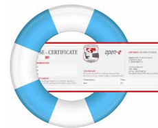
Annual / 3 years 24/7 Support