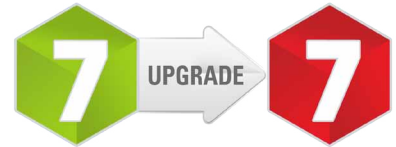
Upgrade from Open-E DSS V7 Lite to Open-E DSS V7