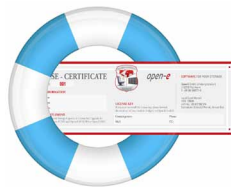
Annual / 3 years Premium Support