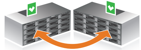
Feature Pack – Active-Active iSCSI Failover