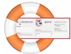
Per Incident 24/7 Support