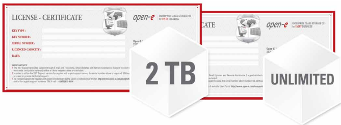
Storage Extensions from 2TB, 4TB, 8TB, 16TB to unlimited Capacity