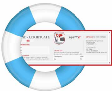
Annual / 3 years Basic Support