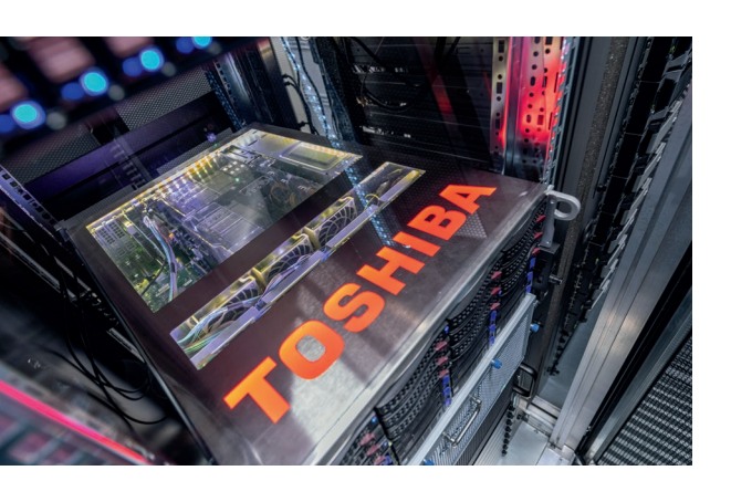
Server and Storage in the Technology Experience Lab